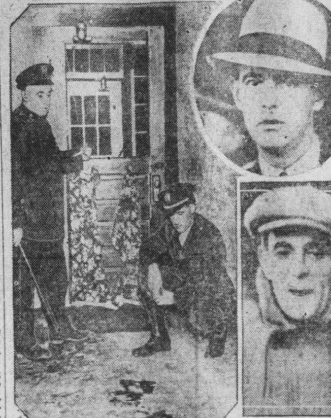
Jack "Legs" Diamond, gang chief, is near death in Albany after being shot from ambush as he was leaving a roadhouse near Catskill, N. Y. Officers are shown examining the spot where he fell after buckshot found their mark. The gangster is shown (upper right) a short time before he was shot in a New York hotel last October and below as he left the hospital after his recovery.