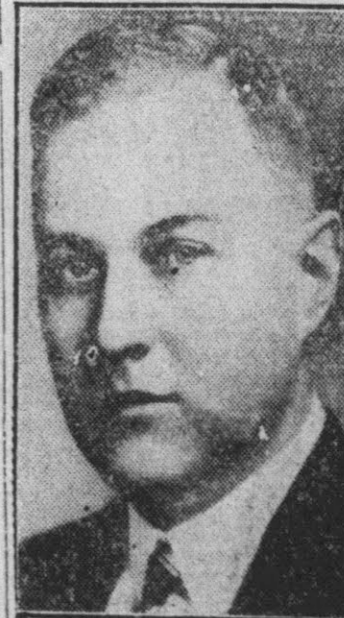
Attorney General John J. Bennett, at the direction of Governor Roosevelt, took over the investigation of the Jack "Legs" Diamond gang and shooting of Diamond near Catskill, N. Y.