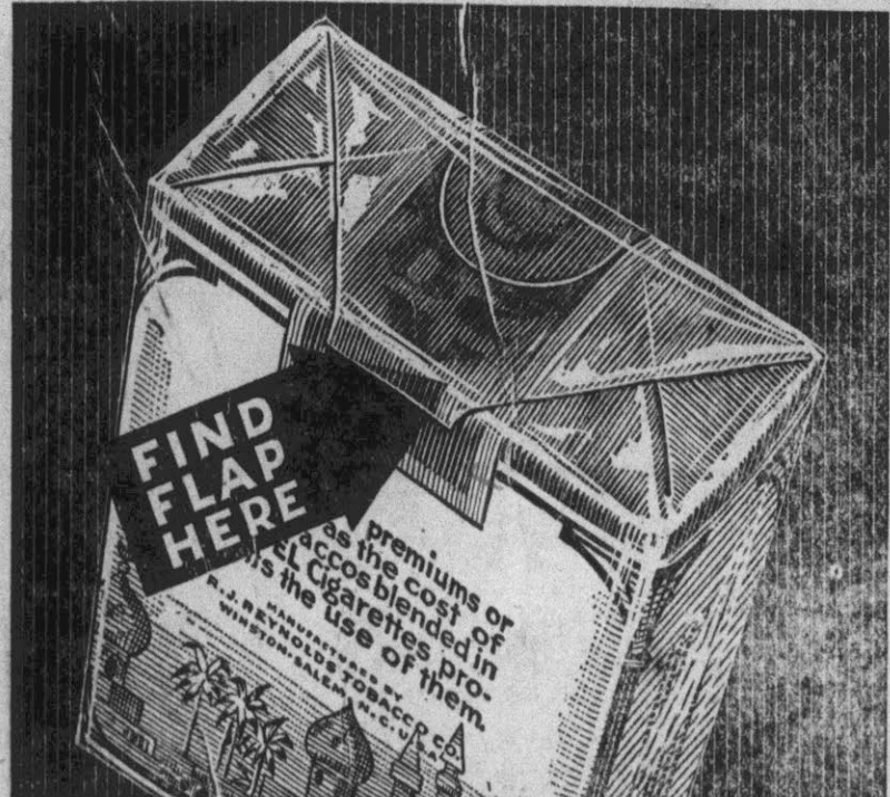
1 Do not tear Cellophane. Look for the convenient flap at the top and back of package