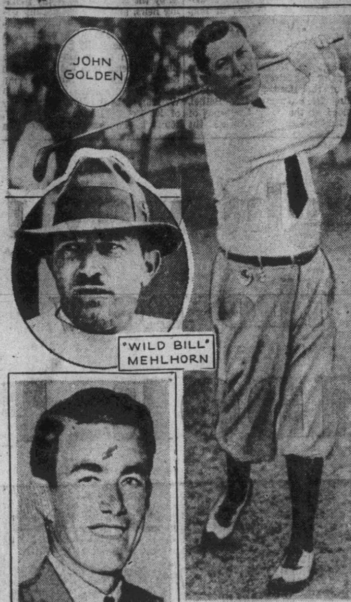
JOHNNY FARRELL Prizes totaling $15,000 have lured the cream of the golf pros to the La Gorce open tourney at Miami Beach, Fla., March 19 to 21. John Golden, sensation of the winter meets, and Johnny Farrell are two of the leading contenders for the La Gorce crown won last year by "Wild Bill" Mehlhorn.