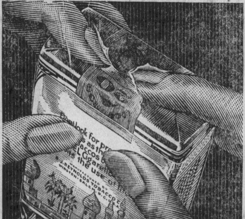
4 To avoid tearing tin foil, slip first finger of each hand under Revenue stamp and break it