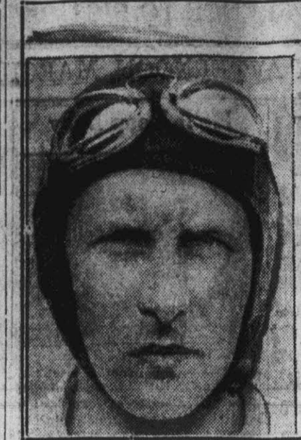
Bernt Balchen (inset), Norwegian-American flier, accepted the task of piloting the giant Sikorsky amphibian, shown above, on a relief expedition into the north to carry food and medicine to victims of the explosion of the sealer Viking off Horse Island, Newfoundland. The flight will be from Boston to Halifax and then to Harbor Grace.