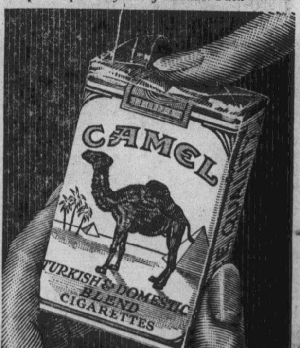
6 Close package. It guards Camels from dust and germs and provides sanitary protection

T HE moment you open the new Camel Humidor Pack you begin to note the advantages of this new, scientific and sanitary method of wrapping Camel cigarettes.