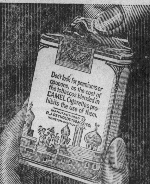
2 Simply lift this flap and you will break the specially devised air-tight seal