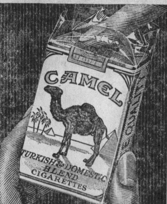
5 Help yourself to a fresh cigarette, then slide package back into its Humidor Pack