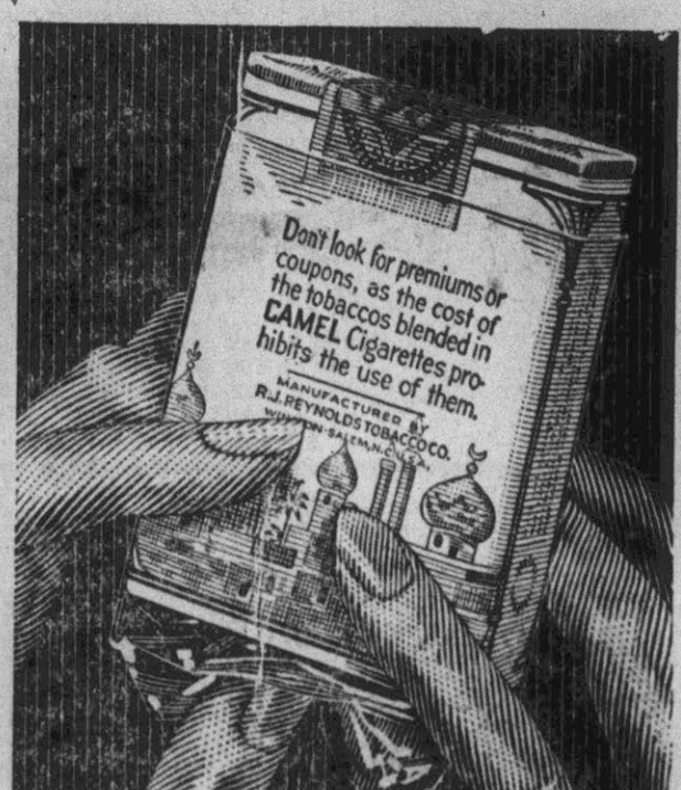
3 Hold package as shown and with your thumbs push it part way out of Humidor Pack