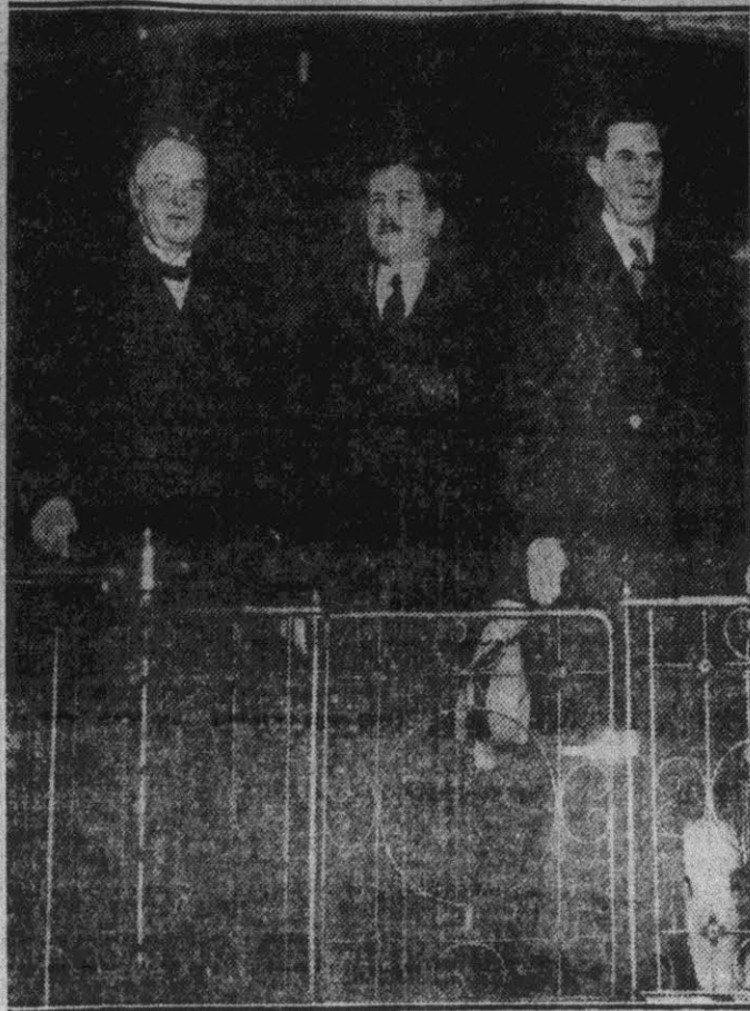
President Herbert Hoover, Secretary Patrick J. Hurley and Secretary Ray Lyman Wilbur (left to right) shown as they entrained at Washington for Old Point Comfort, Va., where they boarded the battleship Arizona to go to Porto Rico and the Virgin Islands. The President's vacation trip will last 10 days.