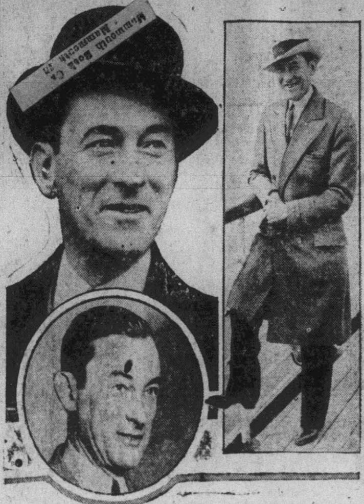
Charges of incompetence and misfeasance, filed against him by the city affairs committee of New York, are absurd, says Mayor Jimmy Walker who is resting in California. The mayor, noted for his dapper dress and ready smile, is shown here in three recent poses.

San Francisco, March 24. (AP)—Charges of incompetence and misfeasance, filed against him by the city affairs committee of New York, are absurd, says Mayor Jimmy Walker who is resting in California. The mayor, noted for his dapper dress and ready smile, is shown here in three recent poses.