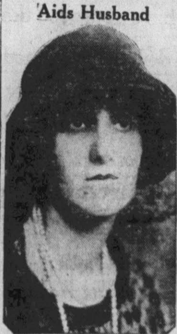
Lady Cynthia Mosley is going to be her husband's "right hand man" in the building of the new British political party which Sir Oswald has launched.

Her's was a beautiful Christian character, and she loved her friends of which she had a great host and was attested by the large floral tribute and the great number that attended her funeral services on a stormy day.