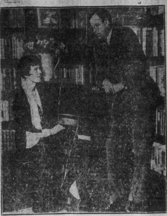
George Palmer Putman, New York publisher, and his bride, Amelia Earhart, first woman to conquer the Atlantic in an airplane, shown in their New York hotel shortly after their marriage.