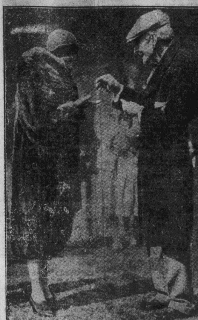
Mary Garden met John D. Rockefeller at Ormond Beach, Fla., and was so impressed she sang some songs especially for his benefit at her concert in Daytona Beach. The diva is shown here receiving one of Mr. Rockefeller's famous tokens—a shiny new dime.