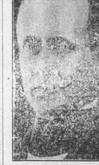
Bishop William T. Manning's attacks from the pulpit on the companionate marriage theories of former Judge Ben Lindsey aroused immediate protests from the latter resulting in his being forcibly ejected from the church.