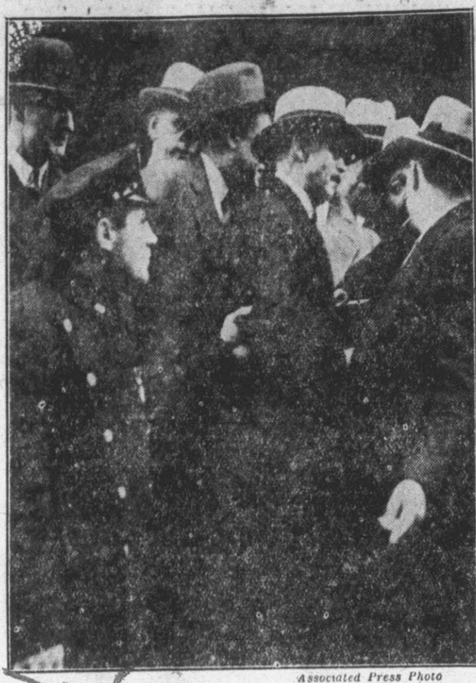
The cathedral of St. John the Divine, New York, echoed with riot and epithets as former Judge E. B. Lindsey of Denver, interrupting Bishop William T. Manning's prayer at the end of a sermon assailing companionate marriage, was ejected. He is shown (center) after his release from a police station.

will have little to do with the successful conclusion of the campaign. Everybody will hope so at least.