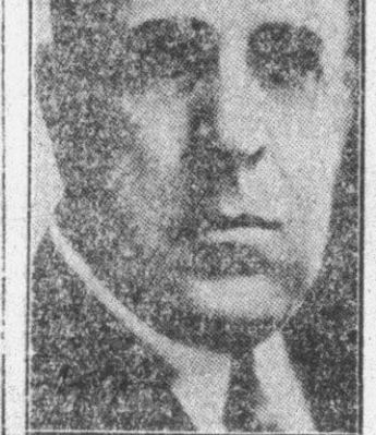
Establishment of the five-day week in all branches of government service was proposed by Senator David I. Walsh of Massachusetts as an unemployment aid.

William Kuhn Arrested for Attempt to Extort $25,000 From Chicago Society Girl