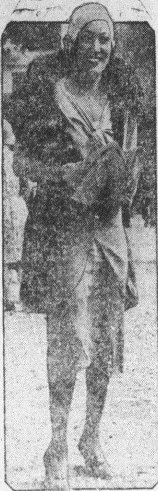
Gloria Swanson, film actress, photographed while attending the races at Deauville, France, recently.