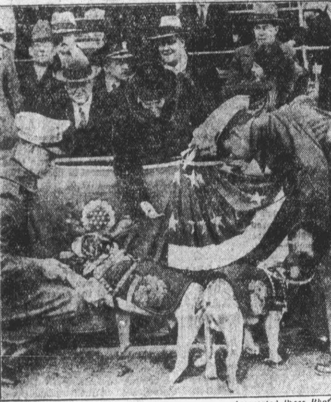
Mrs. Herbert Hoover made friends with the mascots of the marine football team when she and the President attended the marine-coast guard charity football game held in Washington. She is shown about to pet one of the bull terriers.