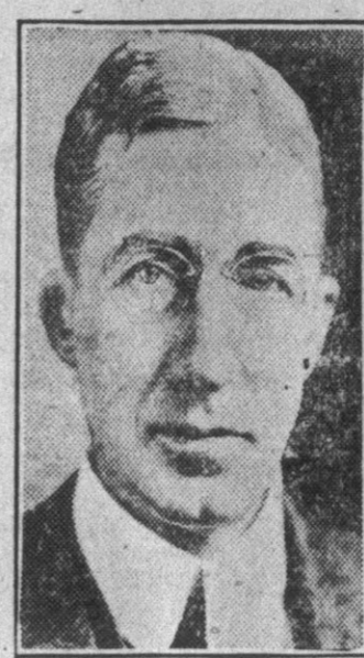
Members of the committee charged with selecting a location for the national home for disabled volunteer soldiers soon will visit southern states to inspect proposed sites. Dr. Hugh S. Cummings (left), surgeon general of the United States public health service, and Gen. Frank T. Hines, administrator of veterans' affairs, are members of the committee.