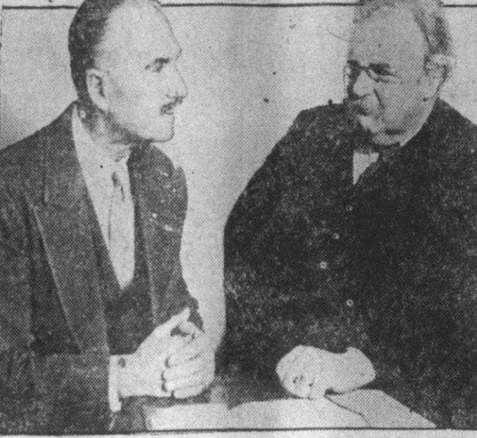
Divorce will be the topic of discussion between Cosmo Hamilton (left), British novelist, and Gilbert K. Chesterton, noted English author, before a New York audience on November 23.