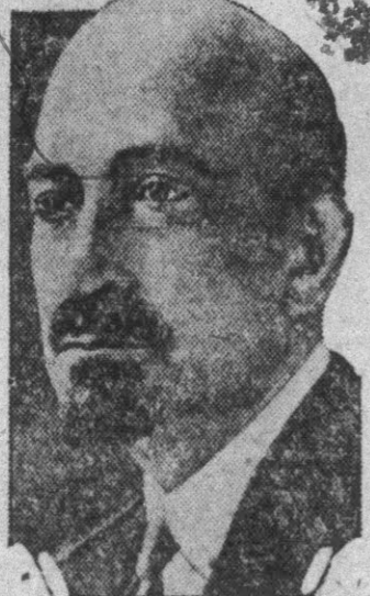
British declaration of policy in Palestine provoked the immediate resignation of Dr. Chaim Weizmann as president of the international Zionist organization and of the Jewish agency for Palestine.

Tax Relief Commission Meeting in Raleigh Today to Discuss Tax Situation Had Requested Governor to Call Special Session On the Tax Question