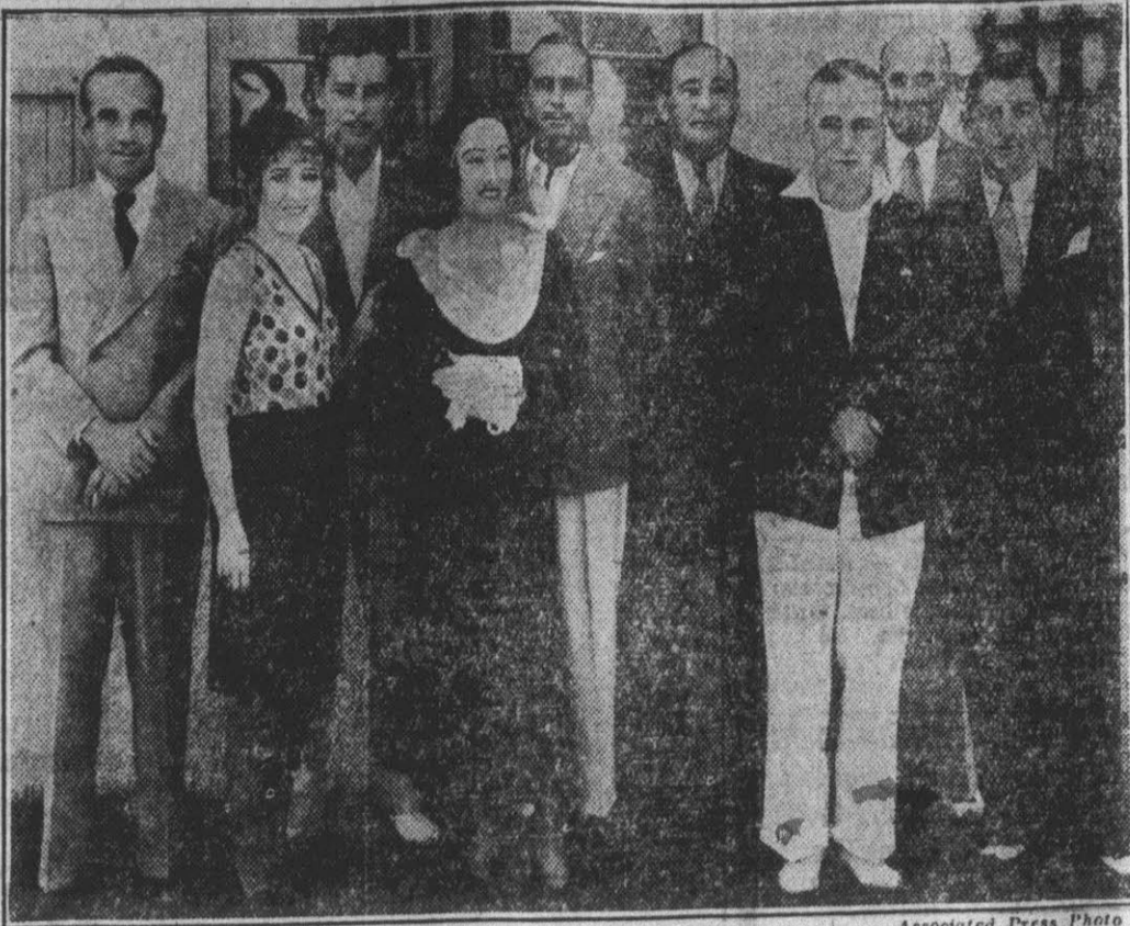
Charging West Coast Theaters is a "monopoly" which seeks to "stifle the endeavor of motion picture artists and producers," these screen celebrities have served notice that they will not show their pictures in this group of theaters. Left to right: Al Jolson, Mary Pickford, Ronald Colman, Gloria Swanson, Douglas Fairbanks, Joseph M. Schenck, film executive; Charles Chaplin, Samuel Goldwyn, producer, and Eddie Cantor.