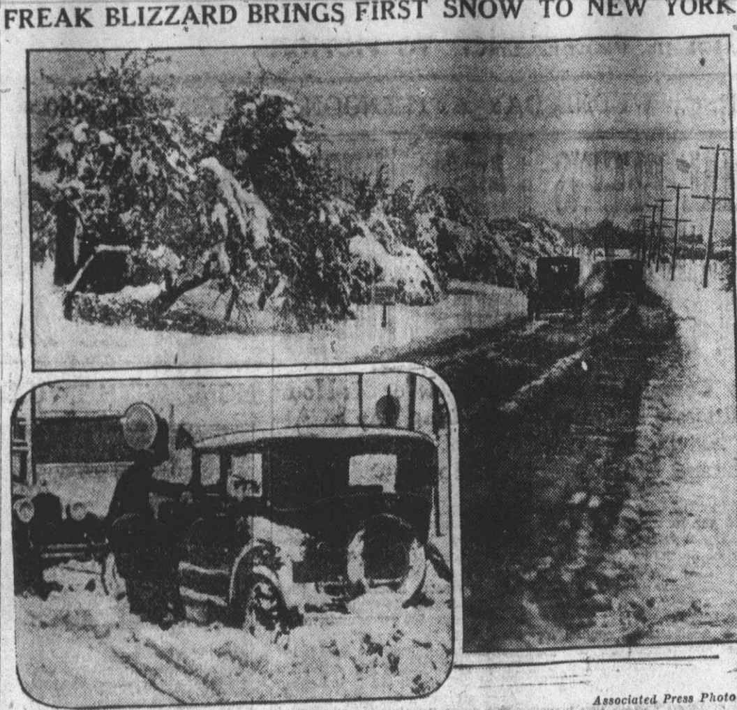
One of the worst October blizzards in the history of the state of New York howled in from Lake Erie and piled snow in depth from nine inches to four feet over a wide area in the western part of the state. Motorists by the thousands were trapped. Above pictures show scenes in the vicinity of Buffalo.