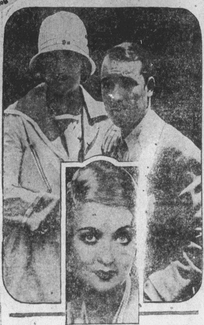
Gloria Swanson, film actress, announced in Los Angeles that she would file suit for divorce from her titled French husband, the Marquis de la Falaise. She said she would name Constance Bennett (inset), actress, in the suit.