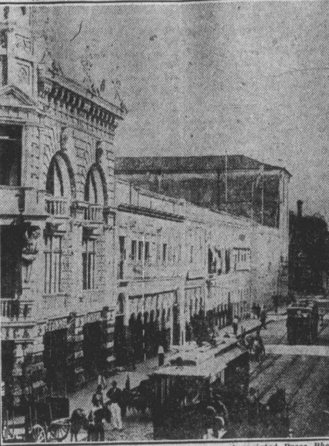
Revolutionary forces from the north which are reported to have captured the government of the Brazilian state of Alagoas, south of Pernambuco, were said to be marching on Bahia. A street scene in Bahia, which has an American owned street railway system, is shown above.