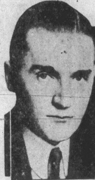
Senator Gerald P. Nye, of North Dakota, head of the Senatorial Campaign Funds Investigating Committee, will open a hearing in North Carolina on next Monday. Mystery surrounds the nature of the inquiry.