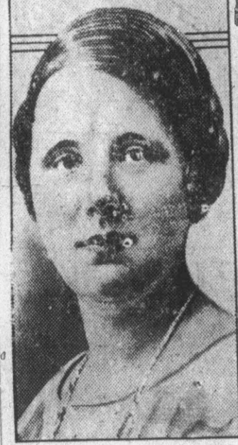
Princess Juliana of Holland is reported to be engaged to Prince Sigvard, son of Crown Prince Gustav Adolf of Sweden.