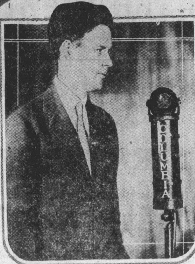
Col. Charles A. Lindbergh making his first formal radio address at the studios of the Columbia Broadcasting System in New York. The address was to have been heard in the far corners of the world by a terrific electrical storm over the Atlantic prevented his words reaching their goal.