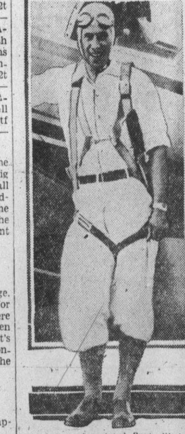
Frank Hawks flew from New York to Los Angeles in 14 hours and 50 minutes flying time setting a new east-west speed record. He stopped five times to refuel.