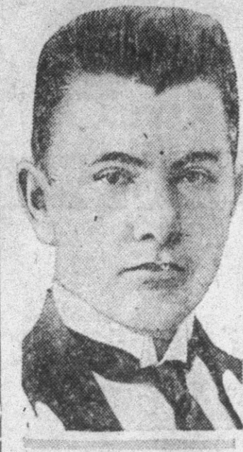
Because the Lithuanian government considered him a "danger to public order and safety," Augustine Waldemar, former premier and dictator, was banished for a year.