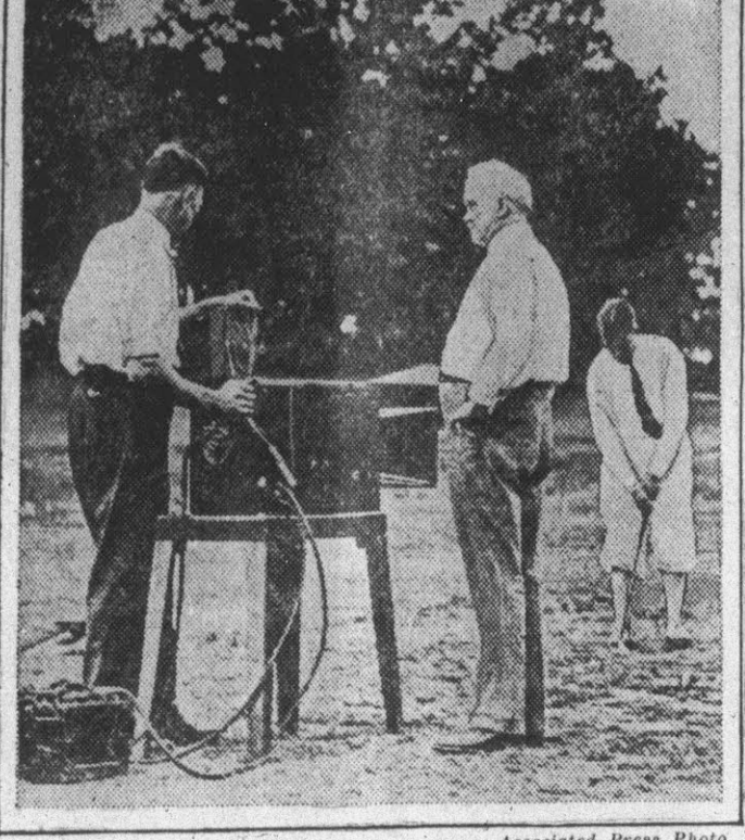
Bobby Jones will appear in pictures for the benefit of golf students. He is shown here having his strokes recorded by a superspeed camera of recent invention. The pictures, which will be used for instruction purposes, will show in slow motion how a champion handles his clubs.