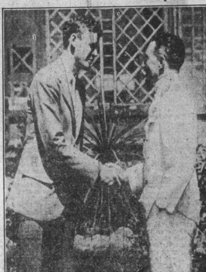
Associated Press telephoto shows Rear Admiral Richard E. Byrd (right) congratulating Col. Charles A. Lindbergh upon the birth of his son. Lindbergh congratulated Byrd upon the success of his Antarctic expedition.