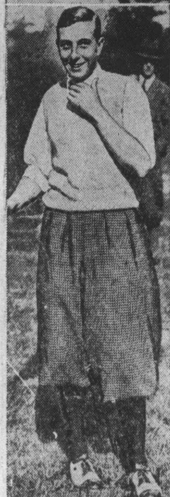
Henry Cotton is one of the outstanding British professionals in the British open golf championship.