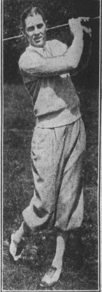
Horton Smith, young American professional, is listed among the favorites to capture the British open golf championship at Hoylake.