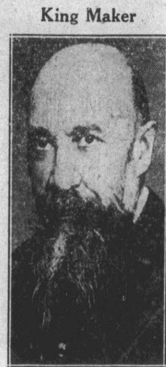
Prof. Nicholas Jorga, once King Carol's tutor, made stirring speech to Rumanian senate which was followed by vote making Carol king. He may head new ministry.