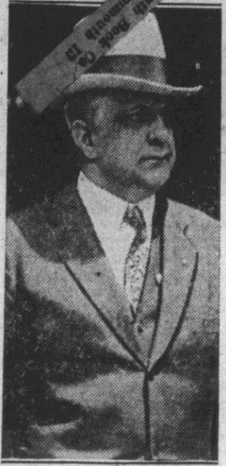
Secretary of Labor James J. Davis shown when he arrived in Washington after winning the republican senatorial nomination in Pennsylvania primary.