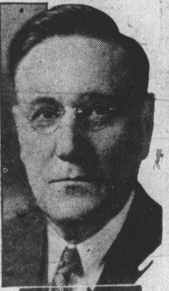
George J. Danforth of Sioux Falls is a candidate for the republican nomination for United States senator in South Dakota.