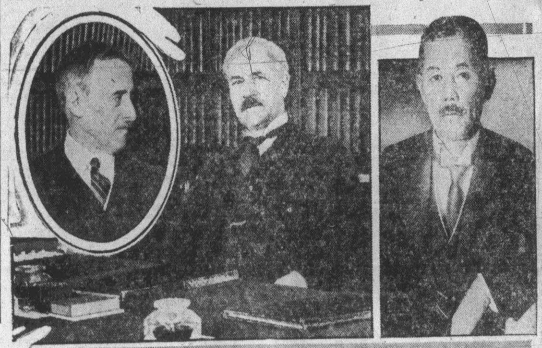
Signature of the three-power treaty with some five-power trimmings completed the long negotiations of the five-power conference in London. The treaty was signed by Secretary of State Stimson (left) for the United States; Prime Minister Ramsay MacDonald (center) for Great Britain, and Reijiro Wakatsuki (right) for Japan.

THEY SIGNED THE NAVAL TREATY AT LONDON TODAY