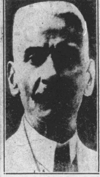
Eugene Roy, who was designated temporary president of Haiti, will take office May 15 when President Louis Borno's term expires.