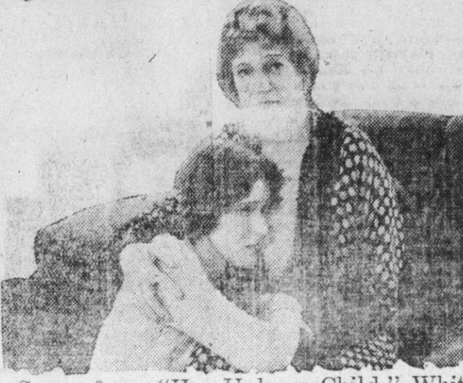
Scene from "Her Unborn Child," Whites Theatre, Thursday and Saturday.