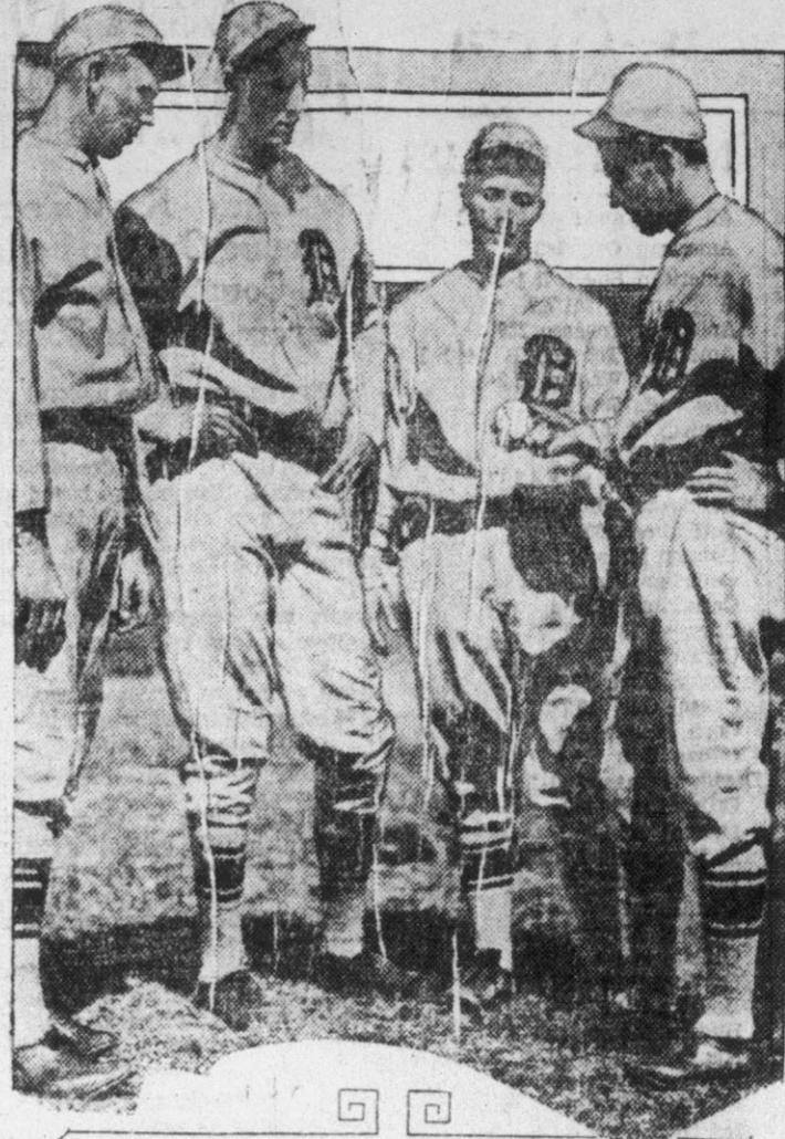
"You grip it this way," says Manager Bucky Harris (extreme right) to three of his Detroit Tiger prospects at the Tampa training grounds. The youngsters are, left to right: Pitcher Nelson, infielder Greenberg and Pitcher Herring.