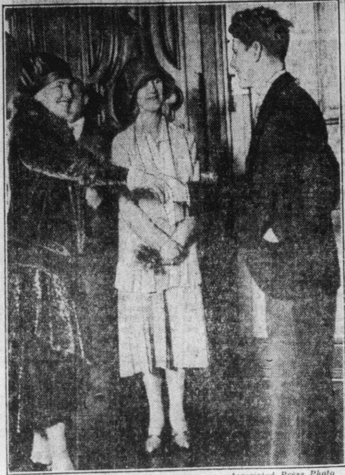
Mrs. Herbert Hoover congratulating Rudy Vallee on his entertainment before the Congressional women's club at its breakfast in Washington.