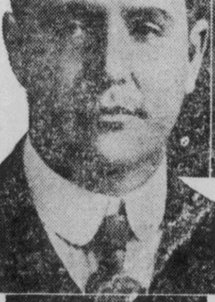
Angel Morales, Dominican minister to Washington, has received strong support for provisional presidency of the Dominican republic.