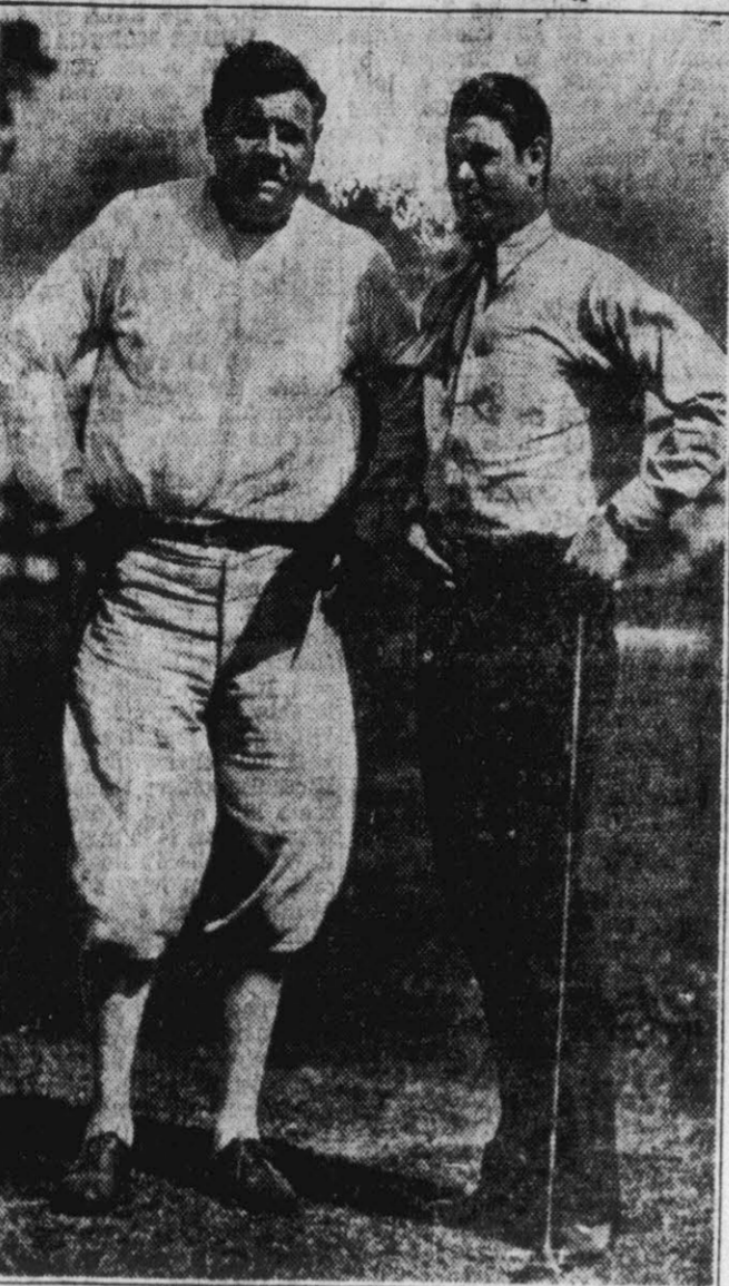
Babe Ruth of the Yankees and Jimmy Fox (right) of the Athletics met on the golf course at St. Petersburg, Fla. Both are going in strong for golf in preparation for training grind.