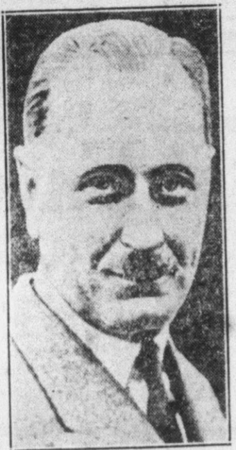
Kaye Don, British racer, will attempt to better the automobile speed record of 231 miles an hour established by Maj. H. O. D. Segrave. The trials will be at Daytona Beach.