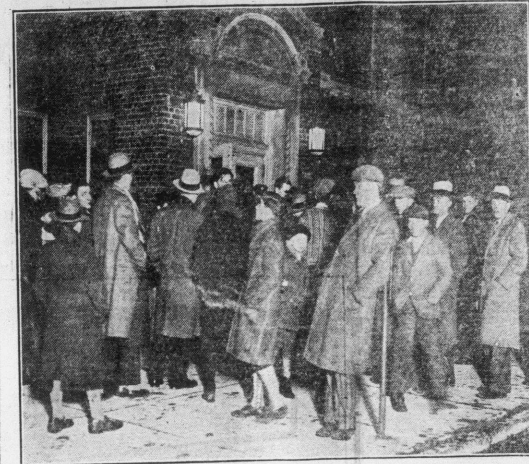
Friends and relatives awaiting news of injured workmen in front of an Elizabeth, N. J., hospital after an explosion in the Bayway refining plant of the Standard Oil Company in which 11 men were killed and fifty injured, more than a score critically. A rupture in a gas line was said to have caused the explosion.