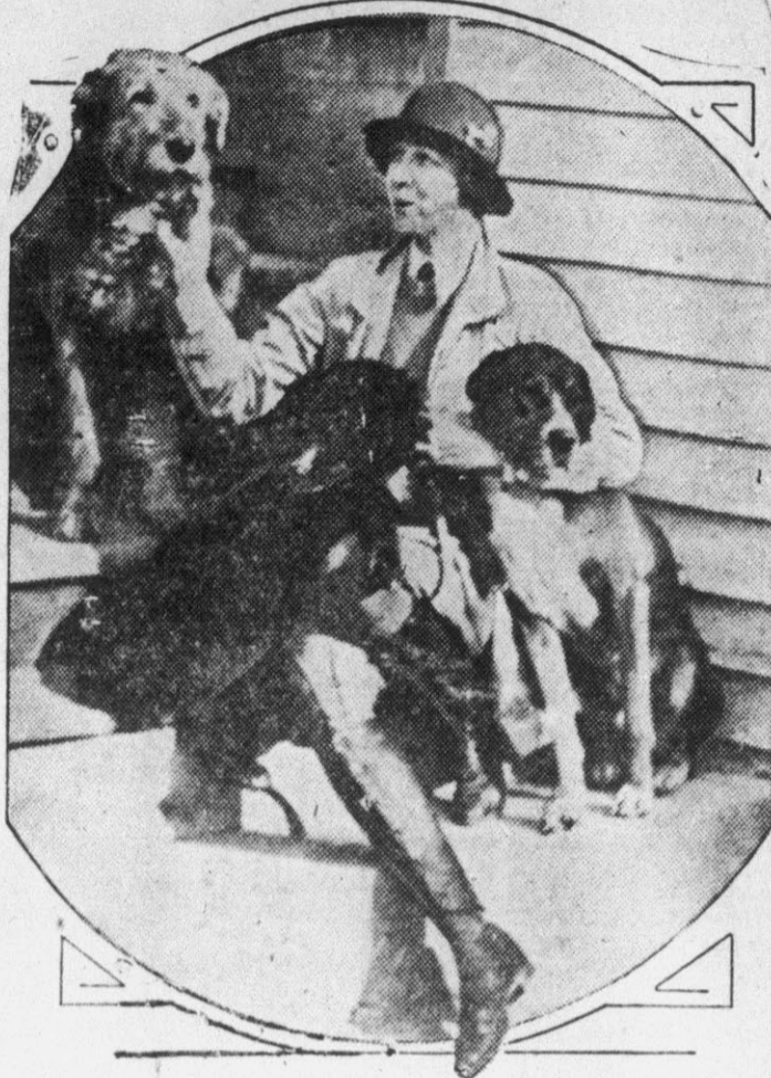
Mrs. Irene Castle McLaughlin, one time noted dancer, stood by helplessly while 90 dogs which she had befriended burned to death when a fire, believed to have been incendiary origin, destroyed her kennels in Chicago. She is shown above with some of her pets.