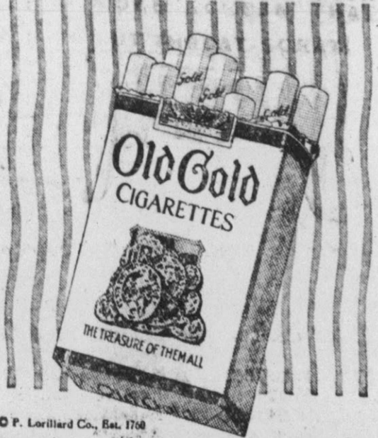
© P. Lorillard Co., Est. 1768

THE SMOKE SCREEN THAT KEEPS OUT THROAT-SCRATCH