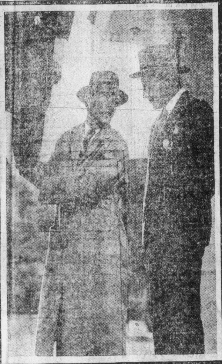
OFF WITH THE OLD AND ON WITH THE NEW! Our experts go over your tires carefully... tell you how much more you can expect from them... then make an offer! What they quote we allow you on a new Silvertown or Silvertown De Luxe.

It is... so come in right away and let's talk it over.