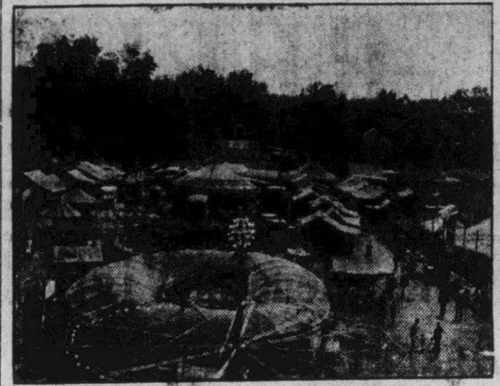
WEST'S GREATER SHOWS WILL BE AT THE PITT COUNTY FAIR