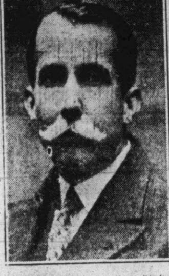
Dr. J. Gustavo Guerrero of Republic of Salvador, was elected president of League of Nations assembly at its initial session in Geneva.