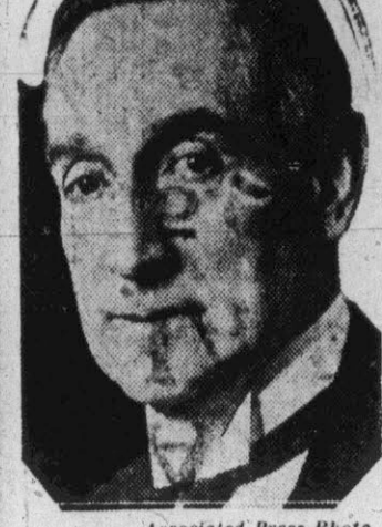
Lord Reading may be sent to Palestine to act as arbiter in the dispute between Arabs and Jews.

by Lewis Forbes; and on the West by Abraham Johnson, being more specifically described by metes and bounds: Beginning at a stake on the Greenville-Tarboro road, a corner between Lots Nos. 7 and 8, thence Eastwardly 1,266 6-10 feet to a stake on the Greenville-Tarboro road, a corner between Lots Nos. 3 and 4; thence N. 28-30 E. 2,400 feet to a canal; thence up the canal to a point where the line between Lots 7 and 8 strike the canal; thence N. 28-30 W. 2,865 feet to a stake in the Greenville-Tarboro road, the beginning and containing 77 9-10 acres, and being Lots Nos. 4, 5, 6, and 7 of the Shelburn farm as shown on map of same of record in Map Book 1 at page 7, of the Pitt County Registry, it being the same land conveyed to R. A. Bryant by W. J. Dunn and wife, by deed of record in Pitt County and the same land conveyed by H. A. Bryant and wife to Albion Dunn by deed of Trust.