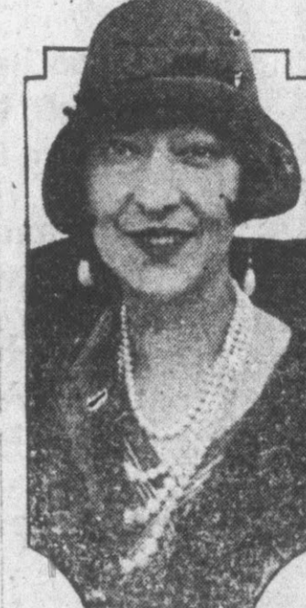
F. Z. Ka Dolly, famous dancer, is charged with swindling Parisian jewelers of $280,000.