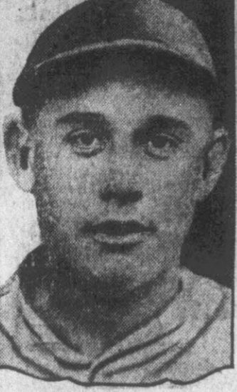
Bill Terry, Giant outfielder, who is leading the National league in the number of hits gathered this season. He had 104 through July 1.