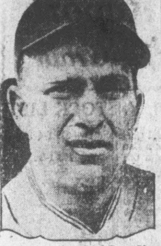
Heinie Manush of St. Louis tops the American League in hits.

even division left the Robins only 3 1-2 games to the rear of the fourth place Cards, who now have lost nine straight and fifteen out of their last seventeen.