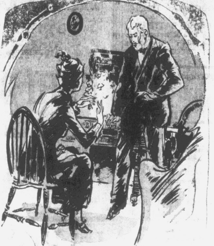
Alex Peterson—Mrs. Lunday screamed—"shot my husband!"

"And the players?" "Ogden would be one of them," MacNair drawled with maddening deliberation.