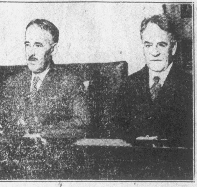
After attending the wedding of his daughter Anne to Col. Charles A. Lindbergh, Ambassador Dwight W. Morrow (right) went to Washington to confer on Mexican affairs with Secretary Stimson of the state department.