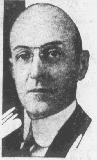
John Lord O'Brian of Buffalo, N. Y., has been appointed an assistant attorney general to succeed William J. Donovan.