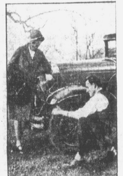
HIS OWN FAULT! Tried to get too much out of a tire that had already given good service!

Now! Bring those old tires to us! They've already given you your money's worth... now we'll take them in... as part payment on new Silvertowns, a single tire or a whole set! Think of it! Old tires that may already be costing you money for repairs... help you save money on husky, long-mileage Silvertowns! A bargain? Of course... for our trade-in allowances are extra-generous right now! Come in... before it is too late! We'll be expecting you!