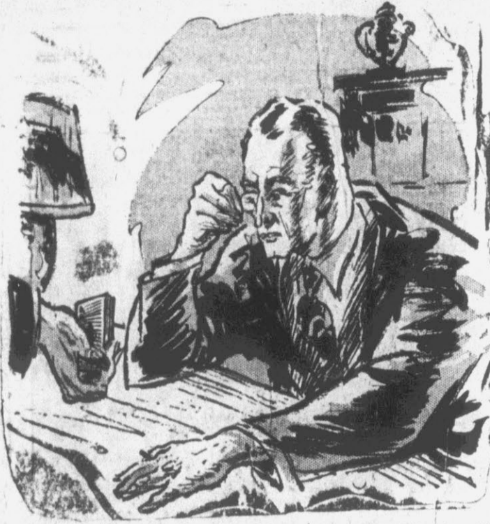
Marked cards—Furlie's lens—"poker game" that cracked the town!

of the parts are missing and we see nothing but confusion. When the pattern is complete we shall probably have as intricate a bit of mosaic work as you or I ever saw.