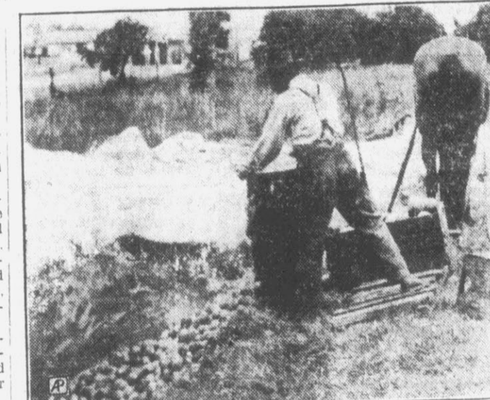
Florida fruit infested by the Mediterranean fruit fly is placed in pits, covered with lime and buried to prevent spread of the pest, for which an area of Florida has been quarantined.