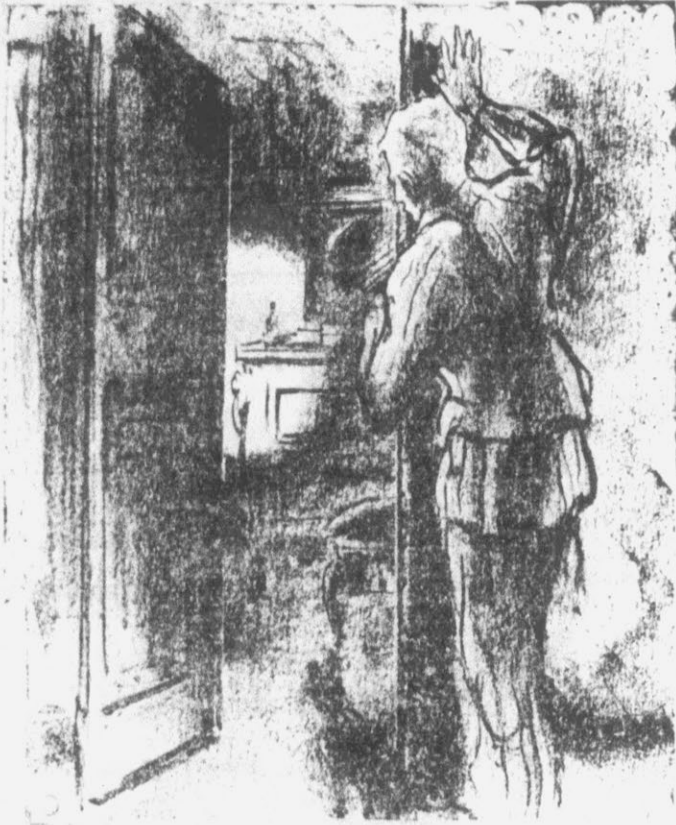
A burglar's searchlight was circling the den.

MacNair, the relentless man-hunter, remained quiet for most of the time while I told him as much as I knew of the case. Occasionally he interrupted with a pertinent, pointed question. "Hyde refused to tell you where he got the pistol?" he growled. "Yes." "And Hubbard heard Ogden shout 'gold bullets' while this man Furie was in the library. Furie, eh? Good name, that." "Are you inclined to connect Furie with the murder?" I asked quickly.