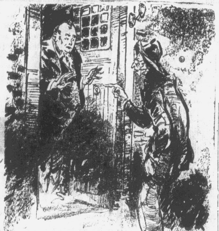
"Tell your boss of Furie is here!"

man endowed with a fine collection of the "civic virtues." I mean that he was conscientious and eminently respectable, restrained and judicial and successful, a pillar of the church and a member of the chamber of commerce. But from time to time I had felt that this conventional being wasn't the real Andrew Ogden; that behind it lived and longed an audacious personality he had never revealed to me but which, somehow, I had sensed and loved. Hubbard came in just then. "I didn't see Stinson around, sir."