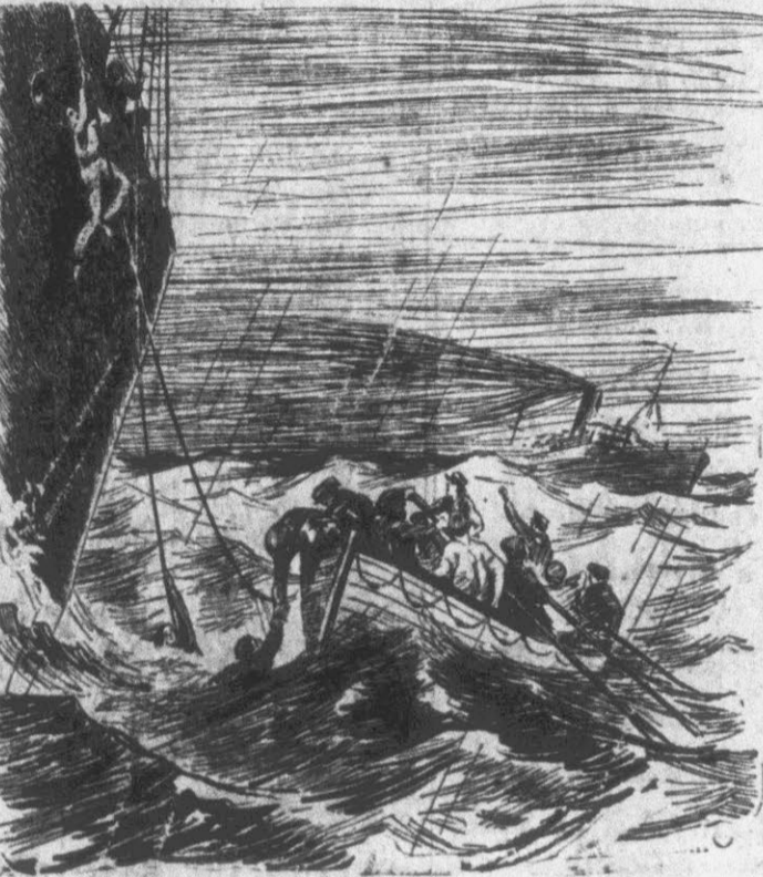
Hand over hand and through the water they worked their way.