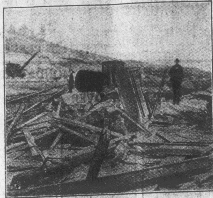
Photo shows wreckage caused by compressed air tank explosion in granite quarry near Stone Mountain, Ga., in which seven workmen were killed.