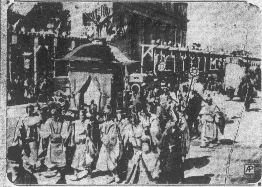
Priests of the Heian Jingu carrying the ark of their shrine in the procession of the "festival of the ages" following the enthronement of Emperor Hirohito of Japan at Kyoto. This was one of the many processions during the elaborate enthronement ceremonies.