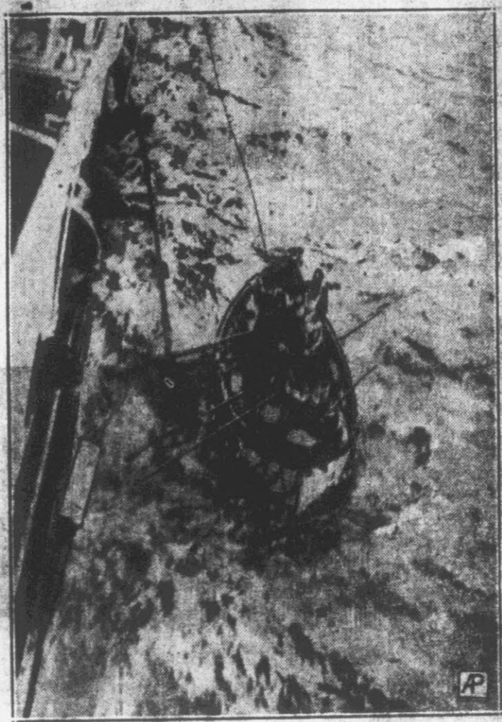
Picture taken from deck of the liner Berlin showing the rescue at sea of one of the lifeboats of the Vestrís which went down off the Virginia Capes.