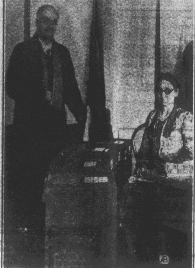
Senator Charles Curtis was a left-handed voter when he marked the ballot bearing his name as the republican nominee for vice-president. With the right hand still in a sling, he dropped his ballot in a box at the Polk school in Topeka, and walked away, his work in the campaign of 1928 completed.