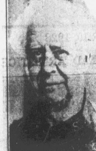
General Bramwell Booth, head of The Salvation Army, who is seriously ill in London, England.