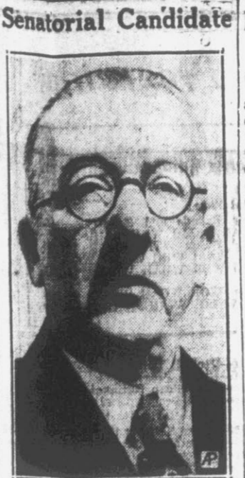
Alanson B. Houghton, ambassador to Great Britain, is mentioned as a likely candidate for the republican nomination for United States senator at the New York state convention at Rochester.

Regular work is laid aside on the campus and appropriate exercises in which faculty, students, and alumnae join, mark the occasion.