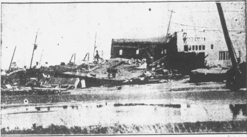
The Scharfsweda Hardware Company building at Okeechobee City, Fla., was one of four large structures to fall before the tropical storm, which caused many deaths and untold property damage.