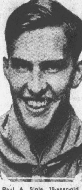
Paul A. Siple, 19-year-old Boy Scout of Erie, Pa., has won a trip to the south pole. He was selected to accompany Commander Byrd from a group of six scouts.