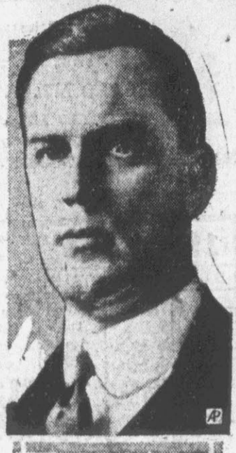
Hjalmar Johan Procopé, Finnish foreign minister, has been chosen to preside over the fifty-first session of the League of Nations council at Geneva.