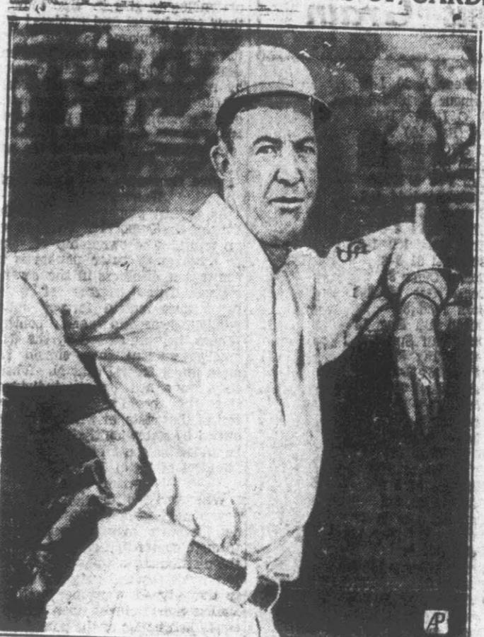
The fate of the St. Louis Cardinals rests in the aged but baffling right arm of Grover Cleveland Alexander, baseball critics say. If the big pitcher, 41, can regain his form they expect the Cards to pull themselves from the slump that cost them the league lead.

hence a westerly course with said First Street, extended 55 1-2 feet to an iron stake; thence No. 58 W. 35 ft., with First Street, to an iron stake; thence S. 32 W. 120 1-2 ft. to a stake; thence S. 5 1-2 W. 205 1-2 ft. to an iron stake on Second Street, thence an Easterly course with Second Street 155 feet to the beginning.