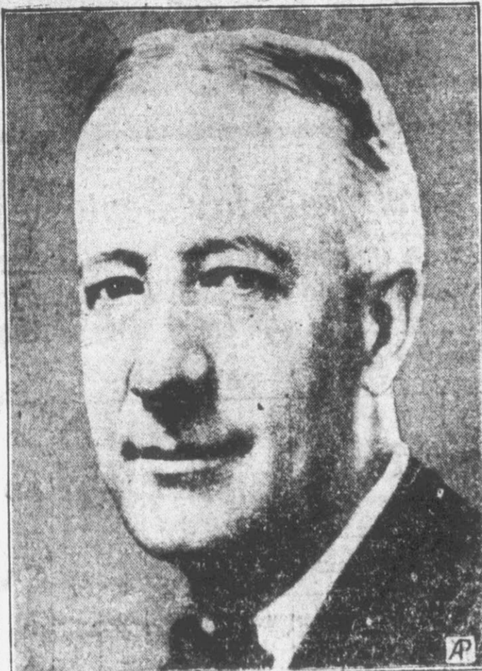
ALFRED E. SMITH

Text of Speech. Upon the steps of this Capitol where twenty-five years ago I first came into the service of the State, I receive my party's summons to lead it in the nation. Within this building, I learned the principles, the purposes and the functions of government and to know that the greatest privilege that can come to