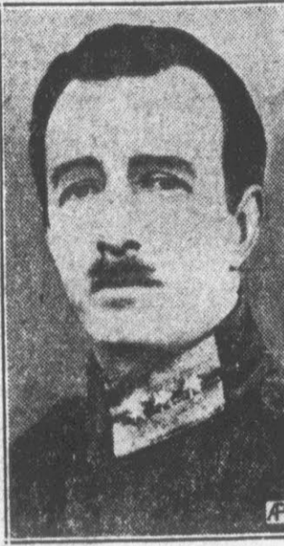
Rumors from authoritative sources say that a monarchy will be proclaimed soon in the republic of Albania with President Ahmed Bey Zogu as king.