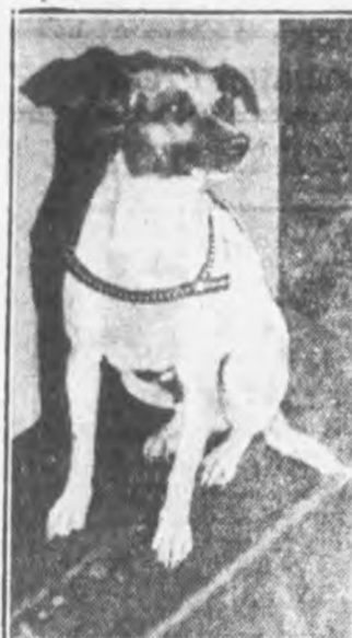
Paramount News—Associated Press

Titina, Gen. Nobile's pet terrier and mascot of the Italia, was one of the first saved from the crash of the dirigible. Titina is shown on the deck of the base ship after being brought in by plane with Gen. Nobile.