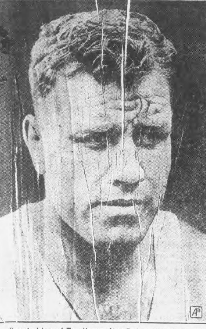
Recent picture of Tom Heene, New Zealand heavyweight title contender who will meet Gene Tunney in New York July 26. It was taken at Heene's training camp at Fairhaven, N. J.