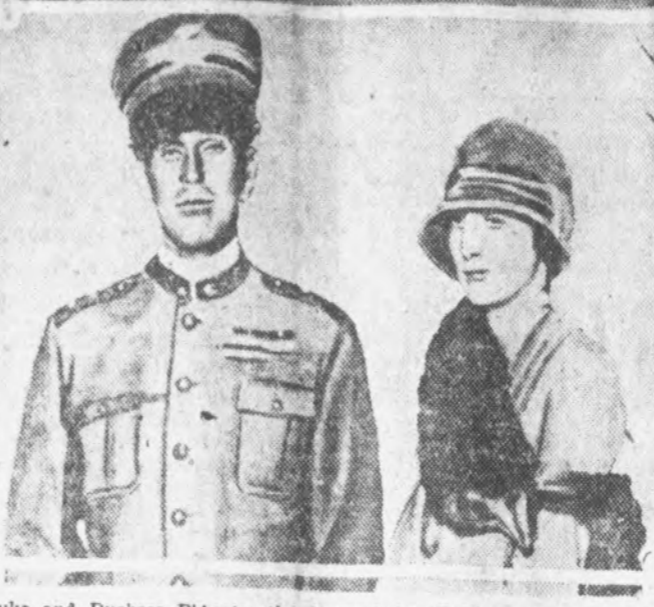
Duke and Duchess D'Aosta, the latter being Princess Anna of Guisa before her marriage, are pictured while taking a stroll in the Eternal City on their honeymoon.