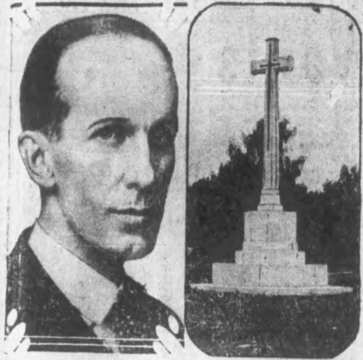
A new monument (right) at Arlington cemetery, presented by Canada, commemorates Americans who died in the Canadian army in the world war. Vincent Massey (left), Canadian minister to the United States, unveiled the shaft on Armistice Day.

Washington (AP)—A monolithic cross of granite, six times the height of a tall man and faced with a superimposed crusader's sword, was unveiled Armistice Day near the tomb of the unknown soldier in Arlington national cemetery as a memorial to United States citizens who enlisted in the Canadian expeditionary force early in the world war.