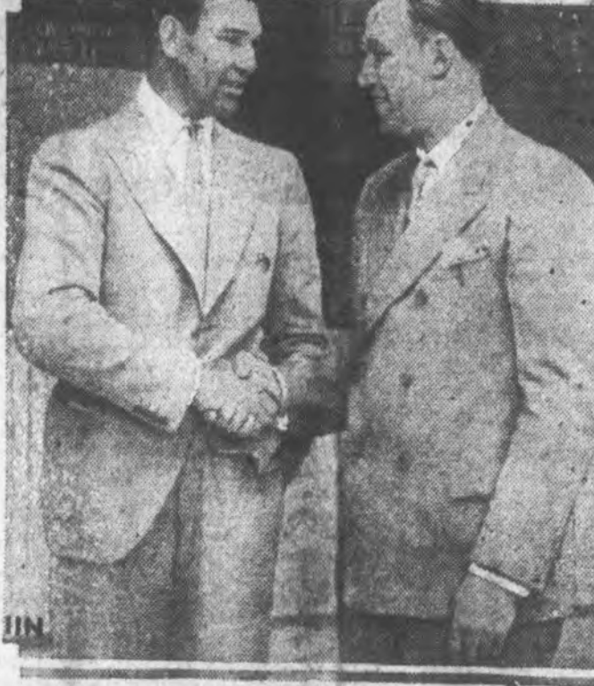
Jack Dempsey and Jack Sharkey, rival fisticufflers, shake hands just to show where's no bad feeling attached to their meeting in the ring. A purely commercial proposition, that's all.