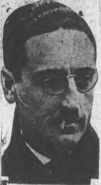
Newest picture of Captain F. T. Courtney, who is preparing to fly from Southampton, England, to New York, stopping in Ireland and Newfoundland.