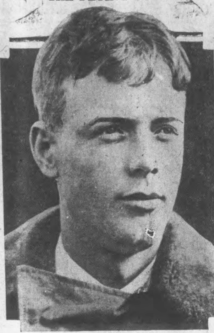
Captain Charles A. Lindbergh is rated as the most daring of the New York-to-Paris fliers—his little plane seats one man, himself. Note his boyish appearance.