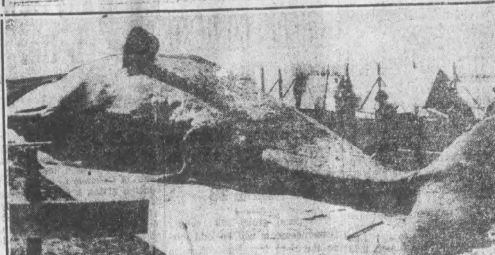
What was said to be the longest whale ever reported in southern waters was captured and brought to Port Arthur, Texas, by Captain Plummer. The beast was eighty feet long.