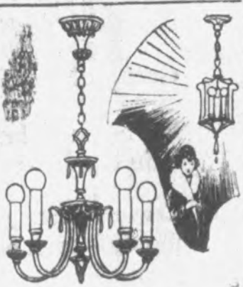
ABUNDANCE OF LIGHT

All! What relief! Your clogged nostrils open right up, the air passages of your head are clear and you can breathe freely. No more hawking, sniffling, mucous discharge, headache, dryness—no struggling for breath at night, your cold or catarrh is gone. Don't stay stuffed up! Get a small bottle of Ely's Cream Balm from your druggist now. Apply a little of this fragrant, antiseptic cream in your nostrils, let it penetrate through every air passage of the head: soothe and heal the swollen, inflamed mucous membrane, giving you instant relief. Ely's Cream Balm is just what every cold and catarrh sufferer has been seeking. It's just splendid.